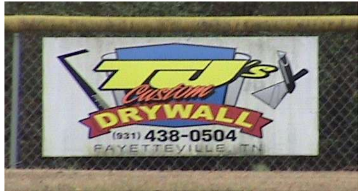
Sign with Logo Art