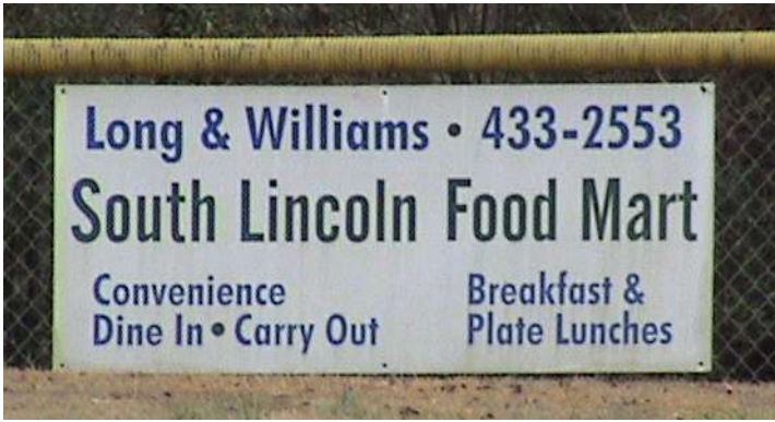
Sign with Words Only